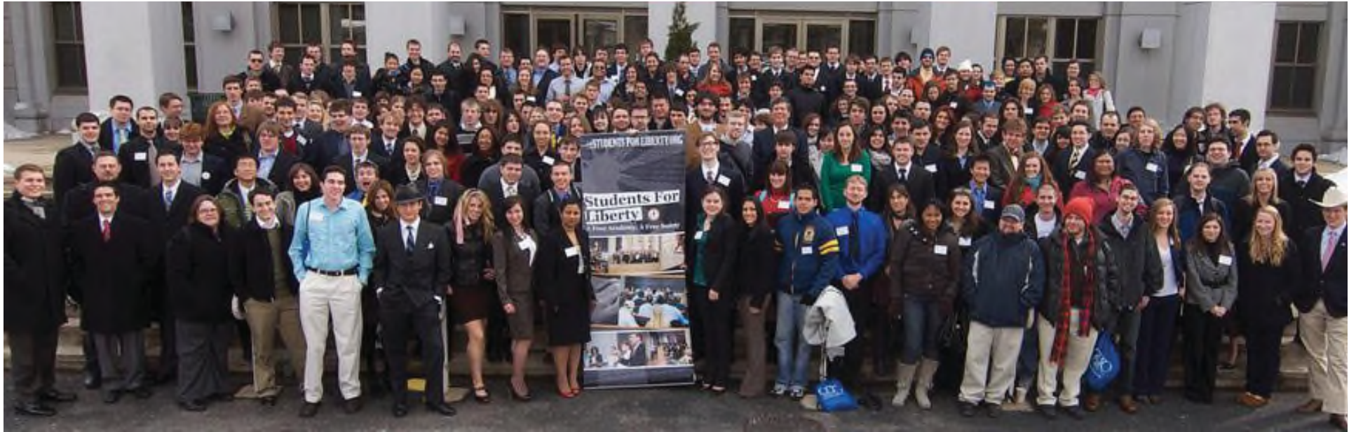
Students for Liberty gather at American University.