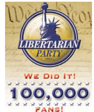
The Libertarian Party's official Facebook page recently hit 100,000 fans.

We want to encourage growth of our Facebook page in any way possible. The benefits we derive from the page are immense. Facebook is the third-highest source of web traffic for our website (LP.org), behind only Google and users who type our web address manually. Facebook gives our blog posts and press releases a huge boost in circulation.