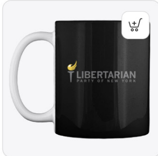
LPNY Logo Store $12.99 Mug