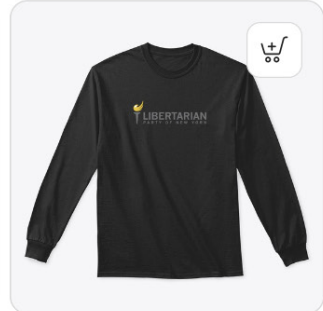
LPNY Logo Store $22.99 Classic Long Sleeve Tee