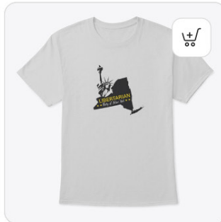
LPNY New Logo Store $19.99 Classic Tee