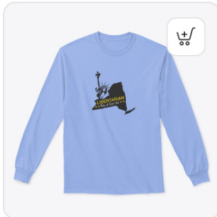
LPNY New Logo Store $22.99 Classic Long Sleeve Tee