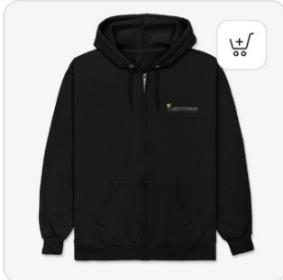
LPNY Logo Store $34.99 Unisex Zip Hoodie