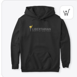
LPNY Logo Store $34.99 Classic Pullover Hoodie