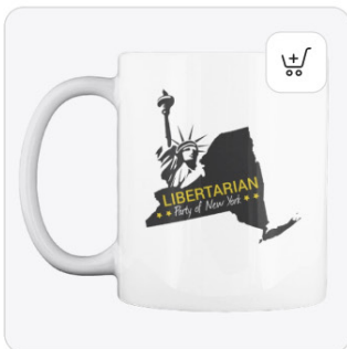
LPNY New Logo Store $12.99 Mug