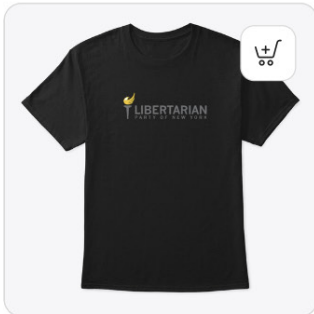
LPNY Logo Store $19.99 Classic Tee