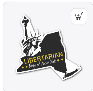
LPNY New Logo Store $7.99 Die Cut Sticker