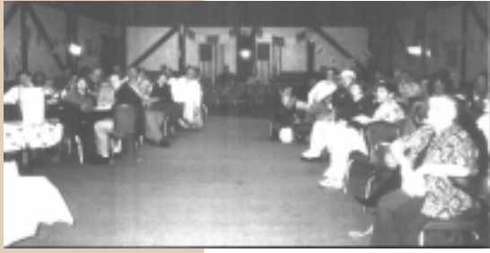
Crowd seen from speaker's position at middle of room (to get closer to audience due to unavailable speaker system)