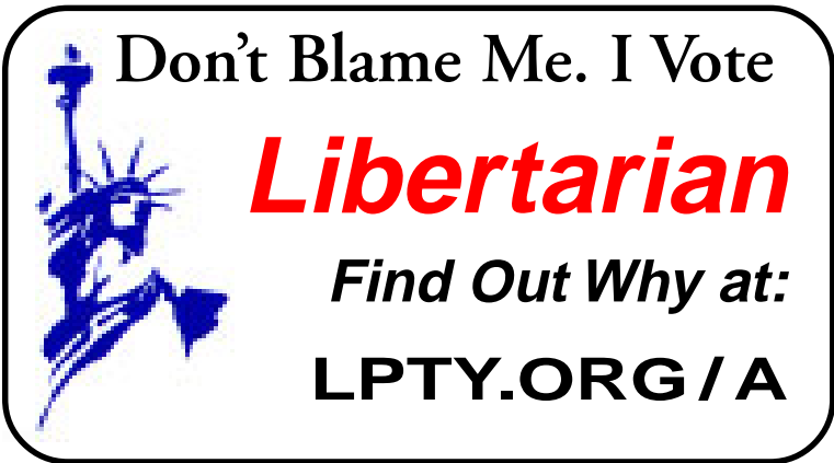
Proposed bumper sticker design based on bumper sticker from national LP

Please let me know by emailing me at rudin@lpty.org..... would you put one of these bumper stickers on the back of your car if it is made available to you by the party at no cost? Also do you already have one up? ■