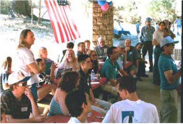
Audience giving rapt attention to one of many speakers