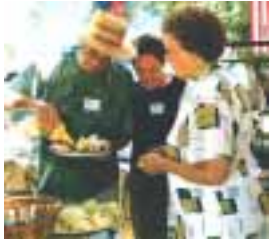
Guest partaking of delicious eats provided gratis by LPSCC