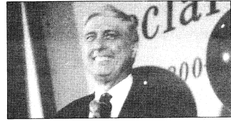
Harry Browne, during National LP Convention.