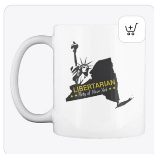
LPNY New Logo Store Mug