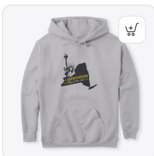
LPNY New Logo Store Classic Pullover Hoodie