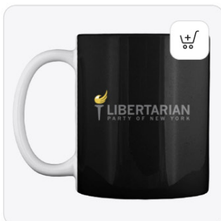
LPNY Logo Store Mug