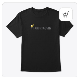
LPNY Logo Store Classic Tee