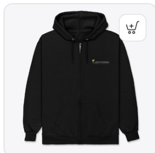
LPNY Logo Store Unisex Zip Hoodie