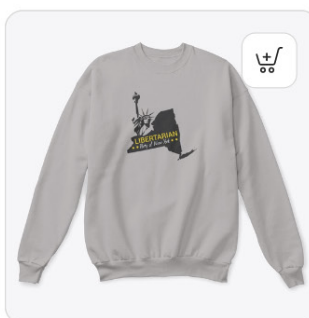
LPNY New Logo Store Classic Crewneck Sweatshirt