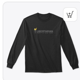
LPNY Logo Store Classic Long Sleeve Tee