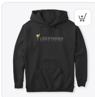
LPNY Logo Store Classic Pullover Hoodie