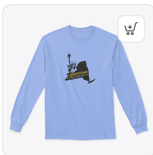
LPNY New Logo Store Classic Long Sleeve Tee