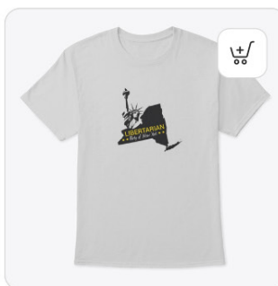
LPNY New Logo Store Classic Tee