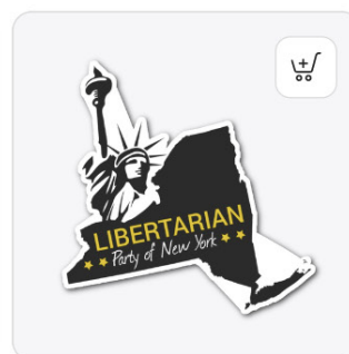
LPNY New Logo Store Die Cut Sticker