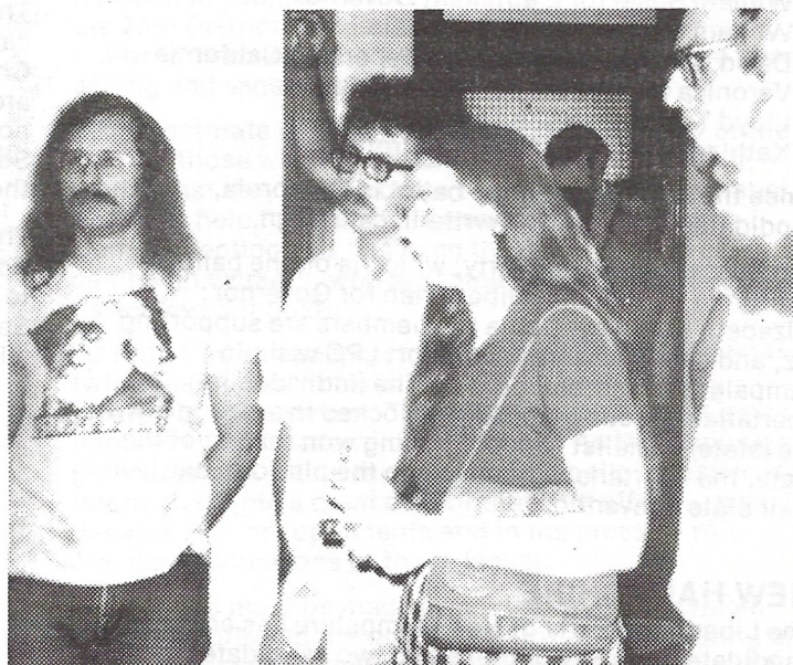
Campaign workers take a break outside FLP office during Thursday night "beer party".