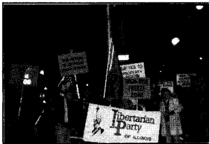
Irate citizens protesting condemnation of Arlington School of Music in front of Village Hall.

Over 50 angry people met at the Arlington Heights Village Hall on the frigid evening of February 16 to protest the unconstitutional and immoral land grab by the Arlington Heights Village Board of the Arlington School of Music through the tax increment financing laws. The rally was organized by the Libertarian Activist Club.