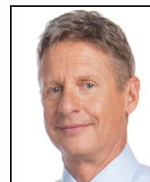
Gov. Gary Johnson