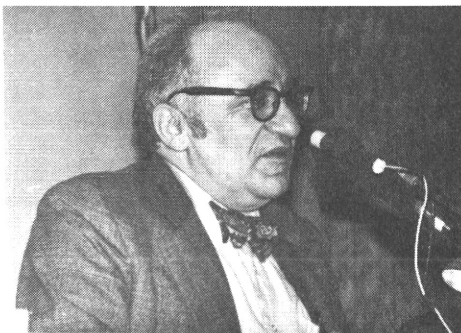
Dr. Murray Rothbard

Addressing over 200 libertarians at the L.P.C. State Convention, Rothbard attacked those who rely only on the educational approach. "The Libertarian Party," he says, "is not only an educational device and a way of organizing libertarians, but also a way of eventual-