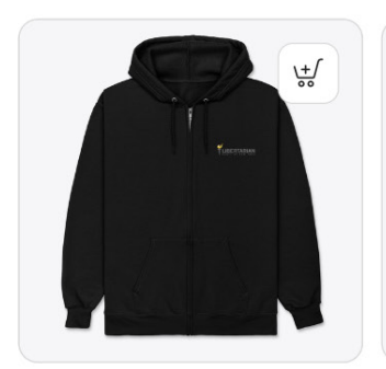
LPNY Logo Store