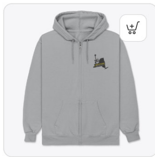
LPNY New Logo Store