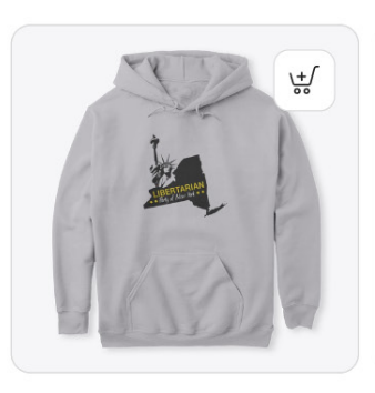
LPNY New Logo Store Classic Pullover Hoodie