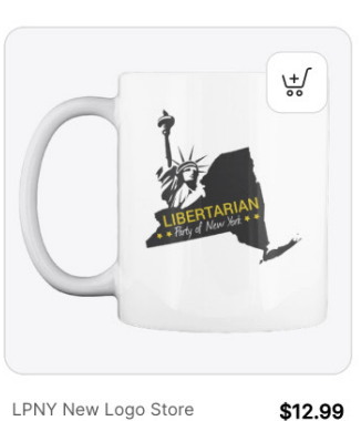
LPNY New Logo Store Mug