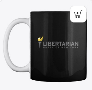
LPNY Logo Store