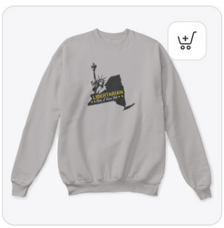
LPNY New Logo Store Classic Crewneck