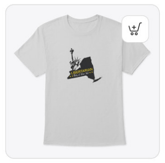
LPNY New Logo Store