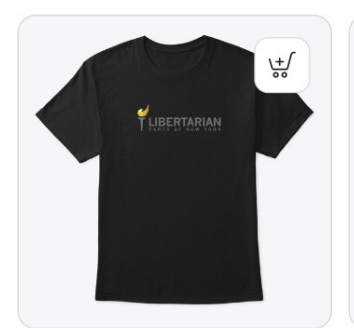
LPNY Logo Store