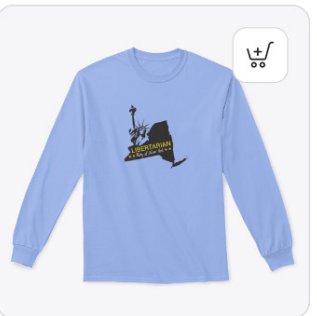
LPNY New Logo Store