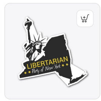
LPNY New Logo Store