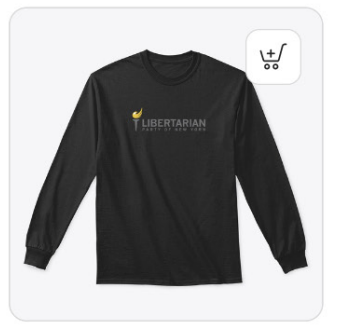
LPNY Logo Store