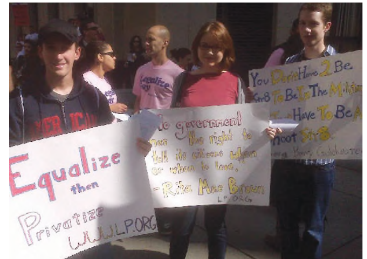
Libertarian interns attend D.C. Equality March.

Instead of urging the government to grant same-sex couples the same benefits as heterosexual married couples, the Libertarian Party advocates for zero government intervention in personal relationships with the goal of privatizing marriage. Libertarians maintain that as long as the government has the power to distribute marriage licenses, it has the power to define marriage itself. Therefore, the only way to preserve the greatest amount of freedom for members of the LGBT community is to regard marriage and other personal relationships as private social contracts, eliminating the special benefits that are assigned to the government sanctioned institution. The government should not treat married people differently from unmarried people.