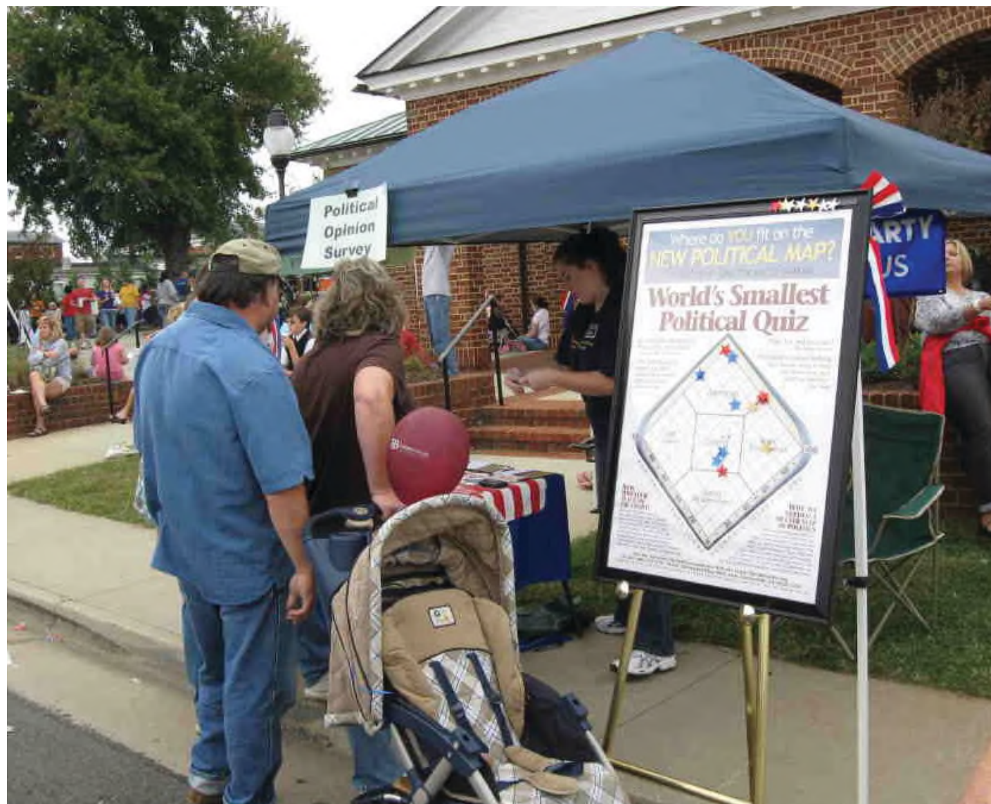
Libertarians from Lynchburg, VA, host an outreach event at the Appomattox Railroad Festival.