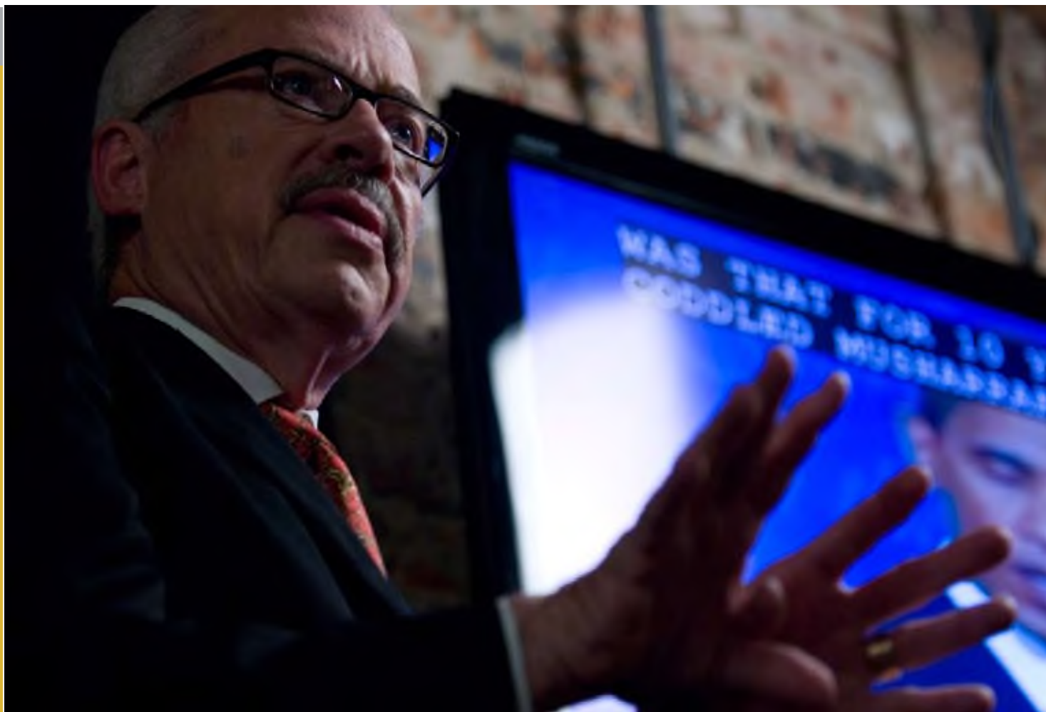
September 26, 2008: Libertarian Presidential Candidate, Bob Barr, joins the Presidential Debates via webcast from Reason Headquarters in Washington, D.C.

Office hours: 9 am-6 pm ET New Member Information: Call (800) ELECT-US E-mail: info@lp.org