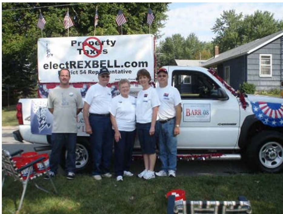
Wayne County Libertarians Participate at the Levi Coffin Days Parade in Indiana