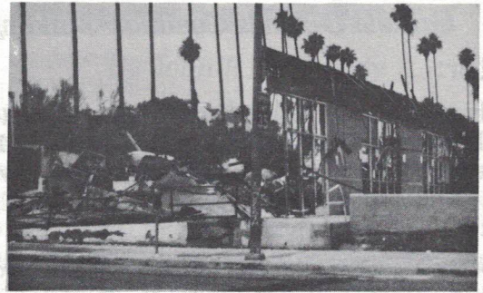
Burned out mini-mall at Venice and Western in central Los Angeles

And if it's legislative office one of us wishes to pursue -- after all, one in 38 of our LPC dues-paid members are running for partisan offices this year -- civic groups are where we can find allies, and finally, supporters. Rather than creating a lot of new problems, the Los Angeles riot has forced people to wake up and see the ones that were already there. It has shaken up peoples' ideas -- and proved that "something has got to be done." If Libertarians do not help to define what has to be done,