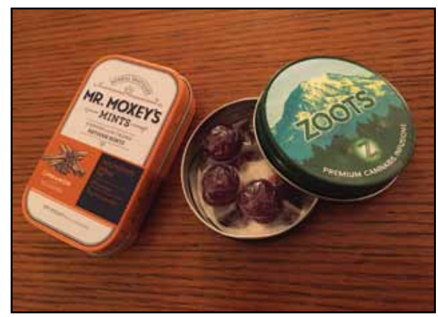
Legal marijuana edibles

Some key statewide ballot-measure wins and losses for liberty are listed beneath this article. •