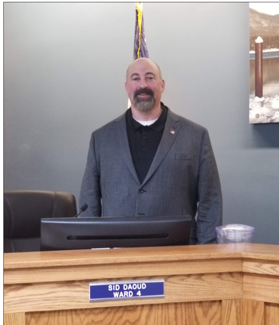
City Councilman Sid Daoud, Kalispell, Mont.

“Government must be transparent and conducted in public with no obstructions,” Daoud said in an email to the LP News. “As a councilman, I should be able to look the public directly in the eye when I vote or take actions that affect them.”