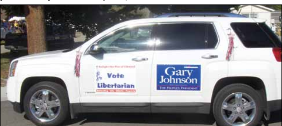
One of LP Montana's parade contingent vehicles

Lesponsible for a professionally run and impressive national convention. Our state was represented by a full delegation of six, plus two alternates, all of whom reported an overwhelming sense of optimism about the future of the LP, and a renewed dedication to advancing the cause of freedom. An unscripted convention process is a source of pride, and proof that individuals can peacefully come