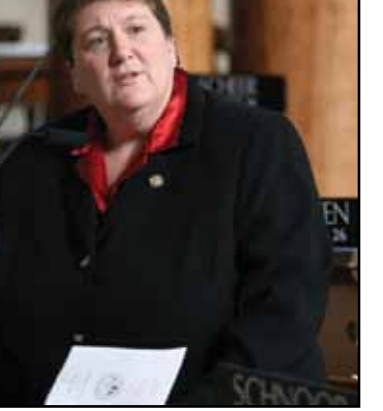
State Senator Laura Ebke (L-Neb.)

ernment out of people's business," she said, according to the Omaha World-Herald.