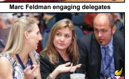
LP Florida delegates