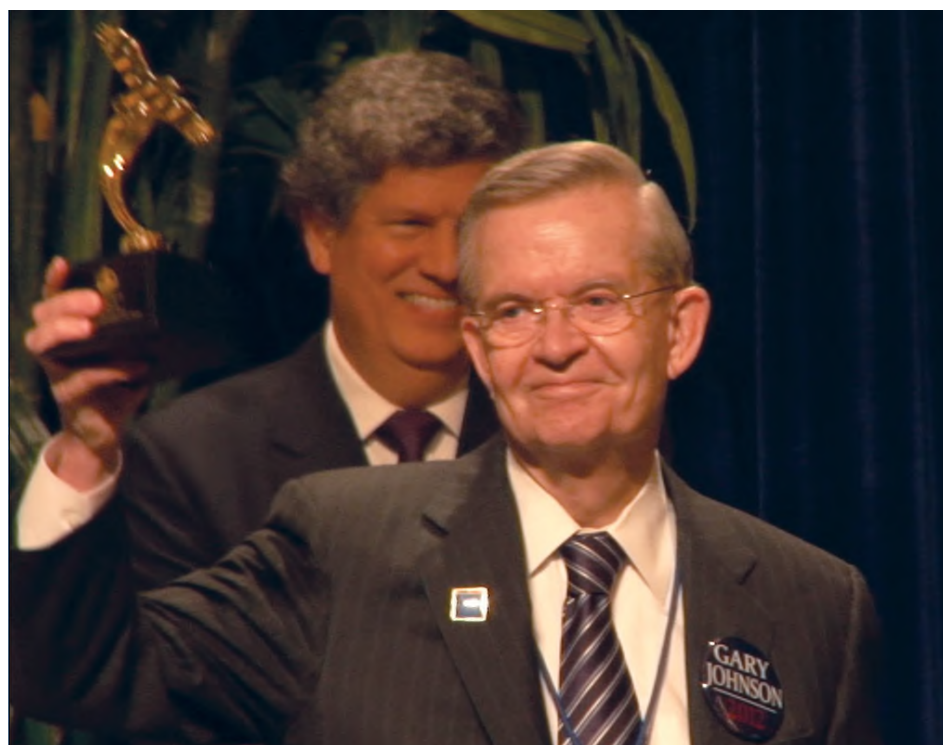
Ed Clark, the Libertarian Party's third presidential candidate (1980), accepts the "Hall of Liberty" award.

The THOMAS PAINE Communication Award was presented to the LP member who has been an outstanding com-