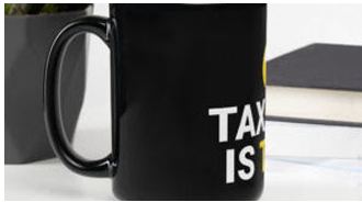
Taxation is Theft Mug