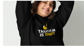
Taxation is Theft Hoodie