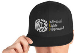
Taxes Suck - Hat