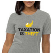
Taxation is Theft Tee