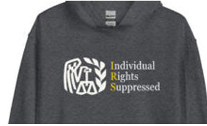
Taxes Suck - Hoodie