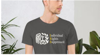
Taxes Suck - Tee