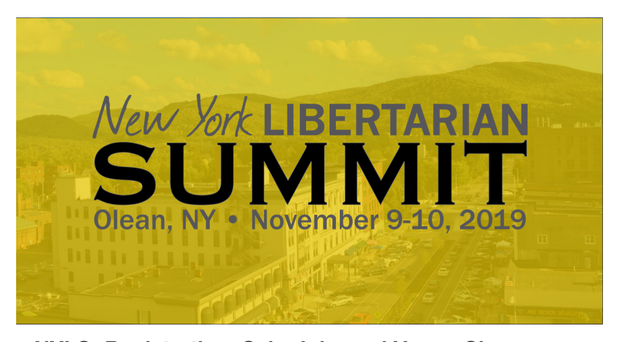
NYLS: Registration, Schedule, and Venue Change