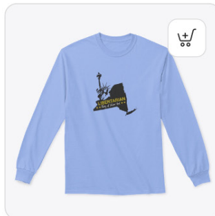
LPNY New Logo Store Classic Long Sleeve Tee