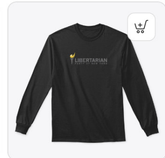
LPNY Logo Store Classic Long Sleeve Tee