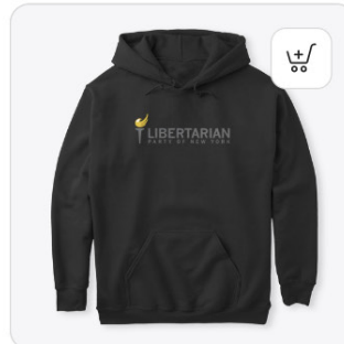
LPNY Logo Store Classic Pullover Hoodie