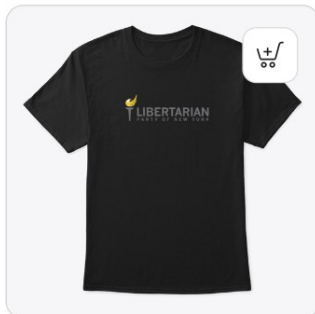
LPNY Logo Store Classic Tee