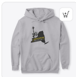
LPNY New Logo Store Classic Pullover Hoodie