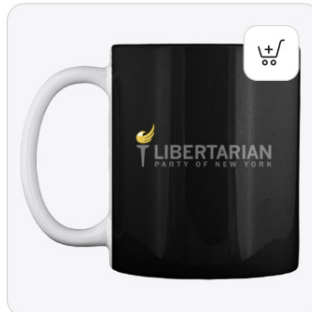
LPNY Logo Store Mug