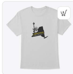
LPNY New Logo Store Classic Tee