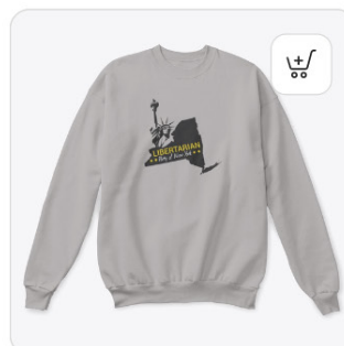
LPNY New Logo Store Classic Crewneck Sweatshirt