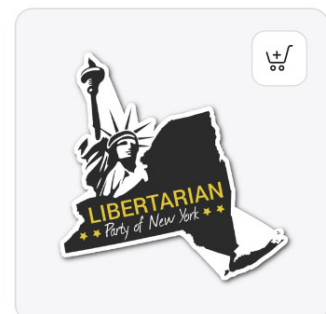
LPNY New Logo Store Die Cut Sticker