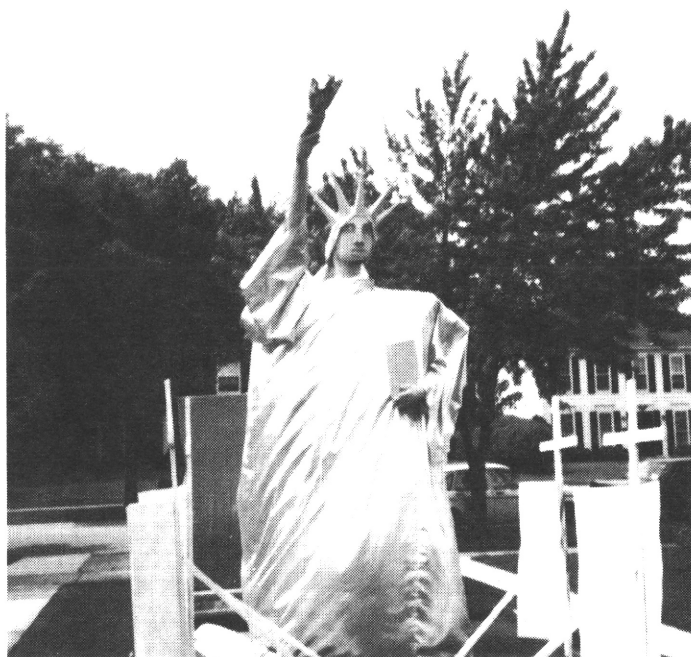
“Lady Liberty” work in progress

The float is “modular” and will be used again in the future, improving on it each time.