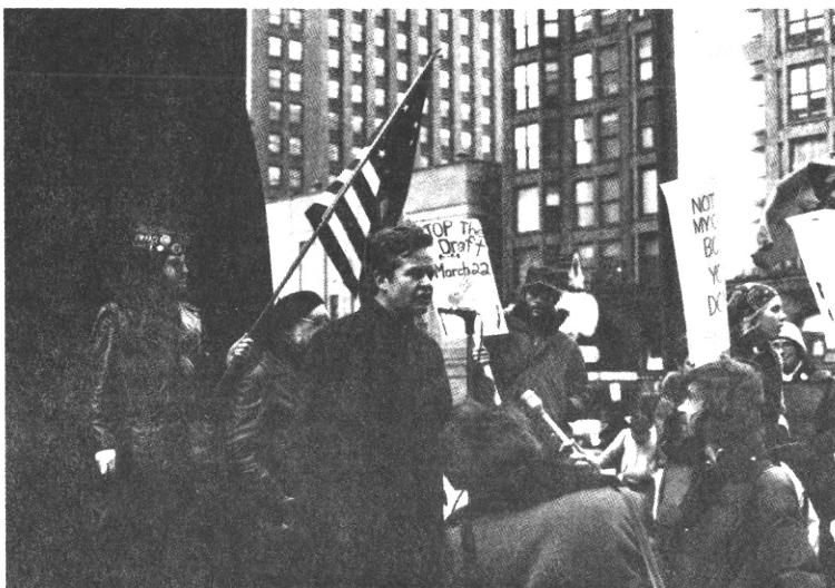
LIBERTARIAN PRESIDENTIAL CANDIDATE ED CLARK ADDRESSES AN ANTI-DRAFT RALLY IN THE LOOP. (ABOVE)