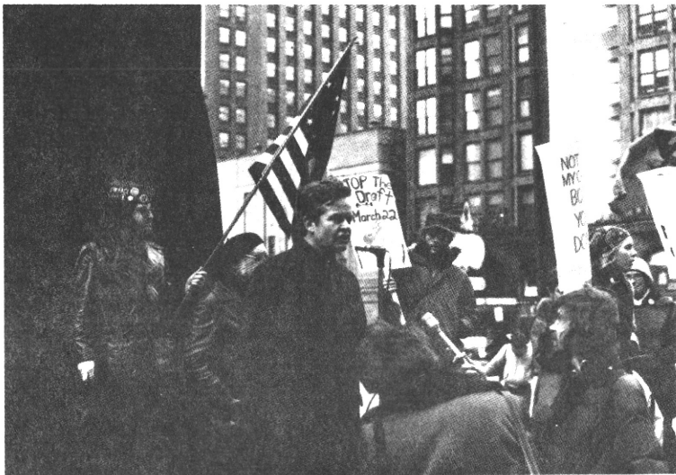
LIBERTARIAN PRESIDENTIAL CANDIDATE ED CLARK ADDRESSES AN ANTI-DRAFT RALLY IN THE LOOP. (ABOVE)