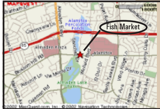
How to get to the Blossom Hill Fish Market

Come and get acquainted and discuss subjects of mutual interest with your fellow Libertarians. See you Thursday, April 17th at 6:30 pm!