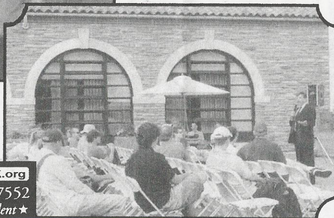
Right: Michael Badnarik speech at CU

In addition, Colorado Libertarians helped to raise more than $12,000 for Badnarik's campaign.