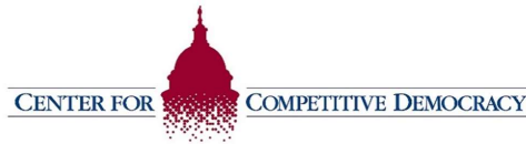
Exhibit 10 (page 1 of 2)