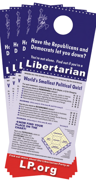
See larger images inside on page 6.

DEFMIL NO. 1541 OKLA CITY, OK NON PROFIT ORG