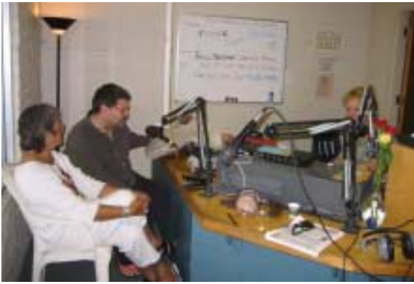
"Free and Clear" Co-hosts - a Demo, an LPer, and a Reform

The LPSCC doesn't often get publicity over the radio waves, but it happened twice in July, once on big KGO 810 AM covering the whole Bay Area, and once on little KKUP 91.5 FM covering all of Santa Clara and Cupertino.