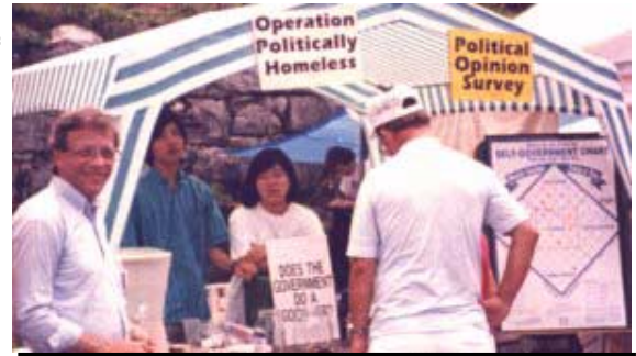
OPH booth - a proven way to gain LP registrations

First, folks who are familiar with the Libertarian outreach booth concept called "Operation Politically Homeless." For you, I'll keep it short and simple in this one paragraph: I need your help staffing OPH booths every weekend (and some weekdays) in September and October. If you volunteer, we'll be at art and wine festivals, farmer's markets, gun shows, flea markets, and many other events. Details are at http://www.sc.ca.lp.org/lpsc-volunteer-oph.html , along with a form where you can let me know which dates/locations you can volunteer for. Or email me at OPH2002@harmless.fastmail.fm , or leave me a message at the Santa Clara LP office: 408-243-2722. It's very simple: the LP will only be at the events you sign up for. No volunteers, no booths!