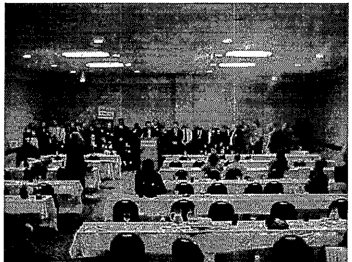
Scene from 2002 Convention