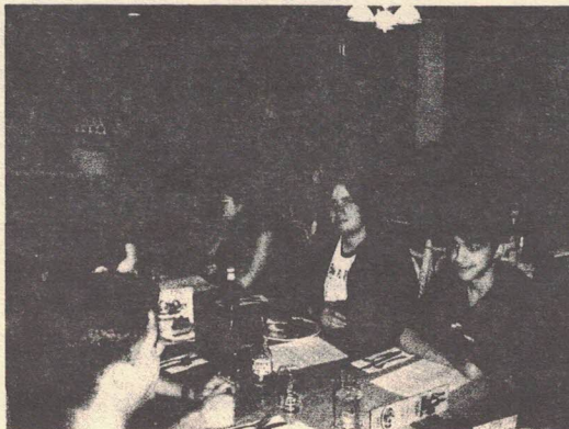
Attendees at our April 14 th Business Meeting