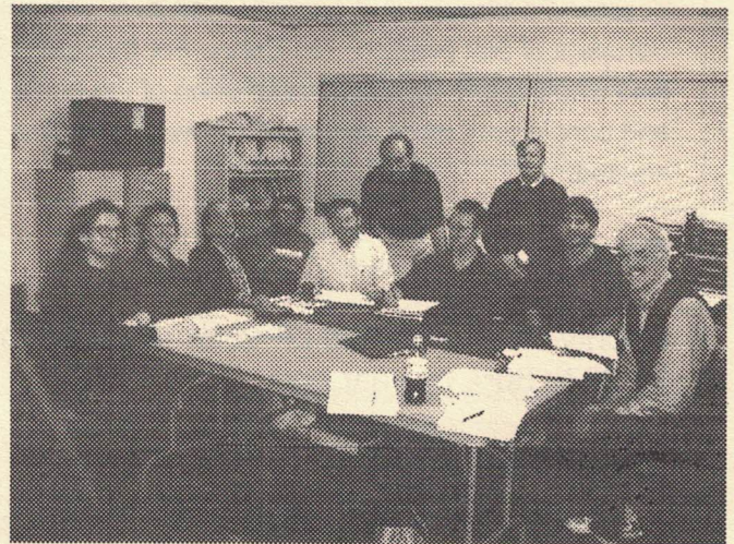
Newly elected ExCom hard at work at their first meeting.