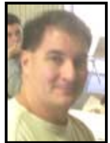
Initiator Prestrelski was interviewed