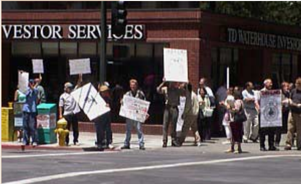
ASA & LP protestors drew TV coverage (but no LP signs)