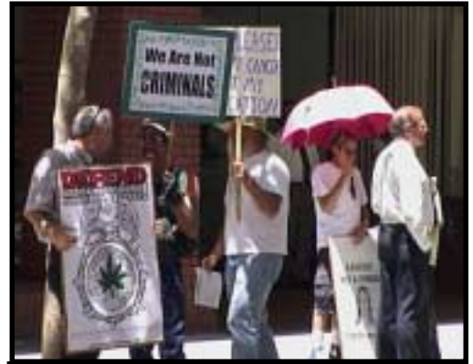
ASA & LP protestors outside San Jose DEA office