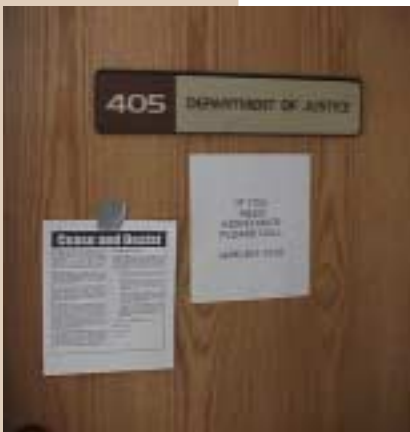
Redress petitions on DEA's locked door :-))

On March 17, 1999, the National Academy of Sciences_ Institute of Medicine (IOM) concluded that "there are some limited circumstances in which we recommend smoking marijuana for medical uses." Despite medical evidence and overwhelming public support, our democratic will is being pushed aside by the Federal Government. Californians passed proposition 215, the compassionate use act, in November of 1996. In March of 1999 a Gallup national survey showed 73% of Americans support making marijuana a prescription drug. We strongly support the passage of H. R. 2592, the States' Rights to Medical Marijuana Act, currently in the United States House of Representatives.