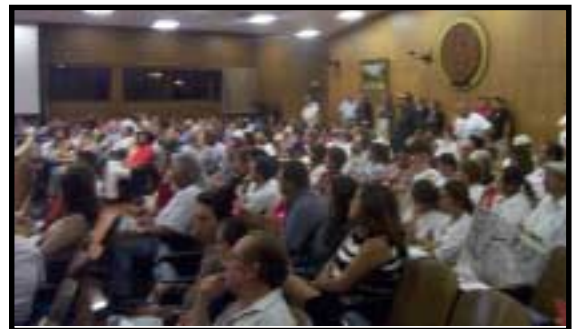
Big crowd at city hall and on cable TV heard LP speakers

able to afford or want to live in the new digs that will be offered after development is completed to the council's and the RDA's taste - (identical since both bodies are one and the same!) probably is of less interest to the council than looking forward to a city that a council member can be proud of. No doubt this program will be tantamount to banishment from the city for many owners and renters. But to insure the appearance of propriety, the mayor, city management, and council concocted a scheme to make it appear that members of the selected neighborhoods were asking for condemnation and redevelopment of their neighborhoods,